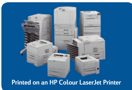
Printed on an HP Colour LaserJet Printer

FollowMe is a secure printing solution that routes print jobs to a Windows PC where the FollowMe Queue Server stores them, ready for printing. Different versions of FollowMe use PIN codes, fingerprint identification, magnetic swipe cards, or Motorola or HID cards to release the print job. In this case, the WSV decided to use proximity cards. Once the user's card is close enough to the proximity card reader, which is attached to the printer, their print jobs are released from the server, and printed.